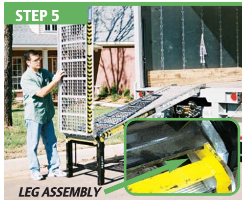
Unfold the bottom portion of the ramp until it rests on the ground. Ensure the YELLOW BAR locks into leg assembly. The ramp should be used only on a flat, firm surface.

The ramp should be ready for use if these steps are followed.