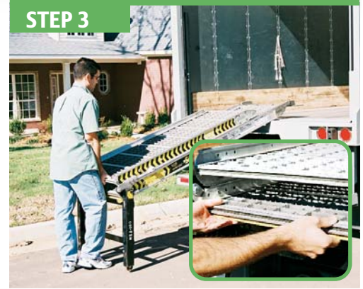
Slide the ramp backward until the apron rests flat on the trailer floor. Place the legs on the ground.