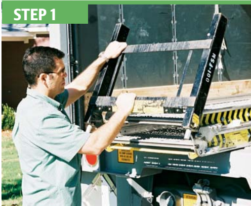
Position the ramp on the trailer as shown and unfold the leg assembly.